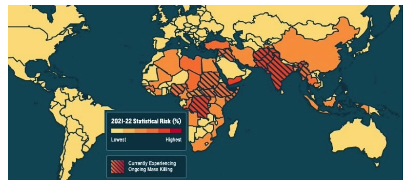
Figure 1: Heat map of estimated risk of new mass killing, 2021–22

Data: Early Warning Project, earlywarningproject.org; cross-hatch pattern denotes countries with ongoing mass killing episodes.